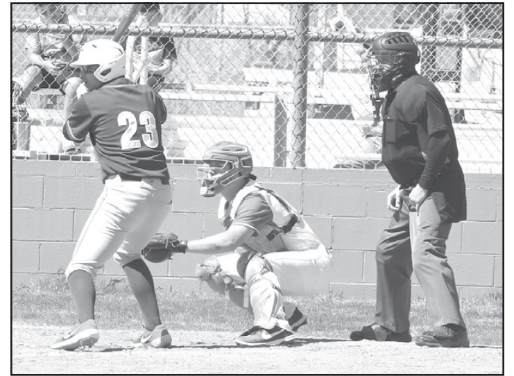
The baseball game this Saturday at River Road has been moved up to a 10:00 a.m. starting time.