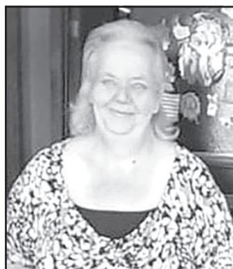
She was preceded in death by her mother and