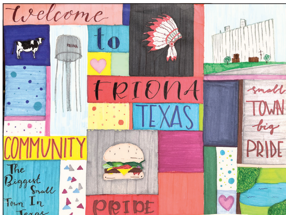
2nd Place - "A Quilted Community" by Ahtziri Soltero