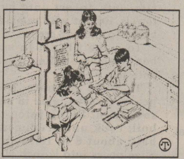
Parent-Teacher stores offer educational resources to parents committed to home schooling.

According to the U.S. Department of Education, the home schooling trend in the United States continues to grow. It is estimated that at least 850,000 children are now being taught at home.