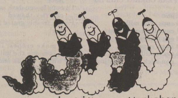
Partners in Liter cy Workshops

"Smokey Joe's Café" Thur, Fri. Sat. Sun. Amarillo Little Theatre 806-355-9991