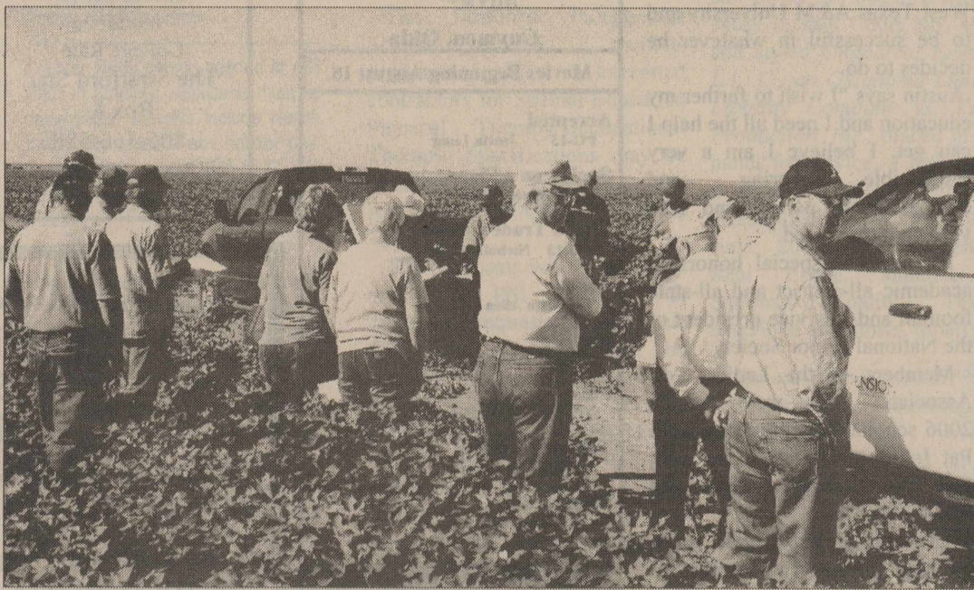
Shown above and below are some of the local area producers and seed dealers that enjoyed the Sherman County Cotton Turnrow Meeting on Thursday, August 10, 2006

Texas Cooperative Extension provides relevant researched based programs. If there is anything that I can do for you please contact me at 366-2122.