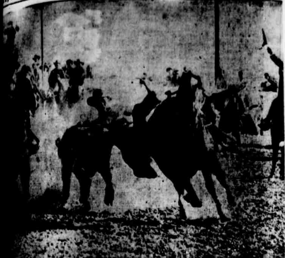
RODING A STEER — One of the rodeo events is bulldogging. Action such as this is the highlight during the 16th annual Santa Rosa Roundup.

Santa Rosa Roundup, June 21 through 24 in Vernon, Texas. An array of top specialty acts plus the Open and Novice Cutting Horse contests round out this year's show to make it the biggest and best ever.