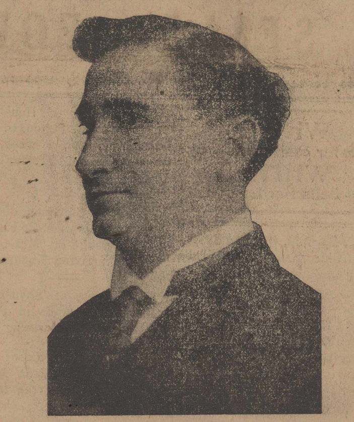
He will direct the song services at the Union Meeting.