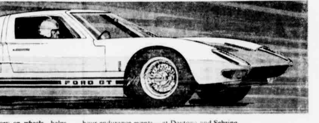
Above: Ford GT—a laboratory on wheels—helps tell us how to build better cars for you. Out-ran, outlasted Europe's finest entries in two 12-hour endurance events—at Daytona and Sebring. The spirit of the Ford GT, down to its distinctive GT stripe, is available now in all 3 Mustang models.