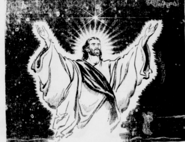
"King of Kings and Lord of Lords" REV. 1916