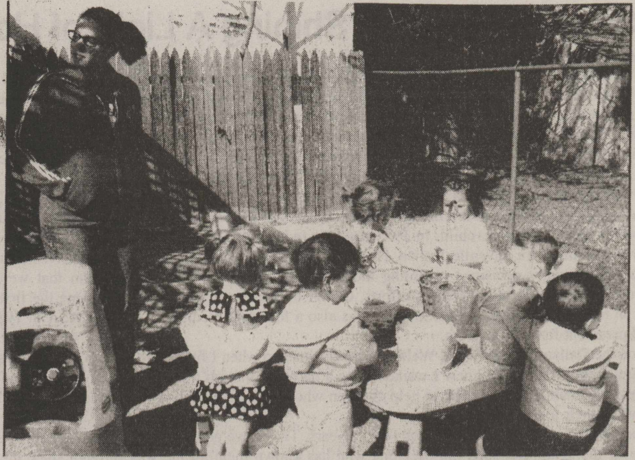
Toddlers at Lollipop Junction are exploring what they found during their Easter egg hunt held Thursday, April 21st.

It is an honor and a privilege for me to serve the community, parents, staff, and students of Stratford ISD. Stratford ISD has done a tremendous job of educating the kids of this community for many years. After completing graduation requirement, our kids have doors opened to them to pursue employment, military option or further their education. This is possible because of the excellent staff, along with the great support of the community. It is my pledge to you to continue this tradition of excellence.