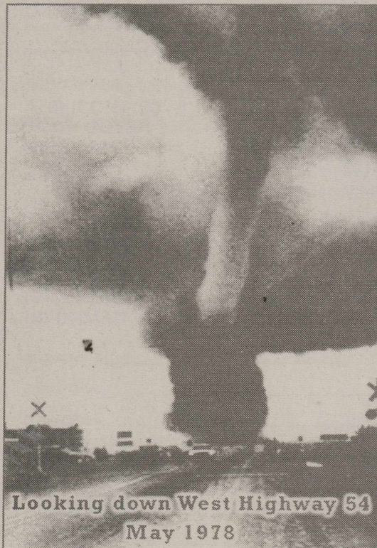
Looking down West Highway 54 May 1978

Do Not forget to set your clocks one hour forward. Spring Forward Time Daylight Saving Time Begins Again