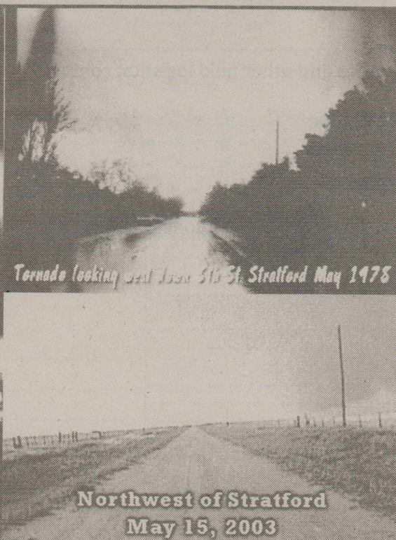
Tornado looking west down 516 St Stratford May 1978 Northwest of Stratford May 15, 2003

When will this happen again? Will you be ready? Make sure you are!