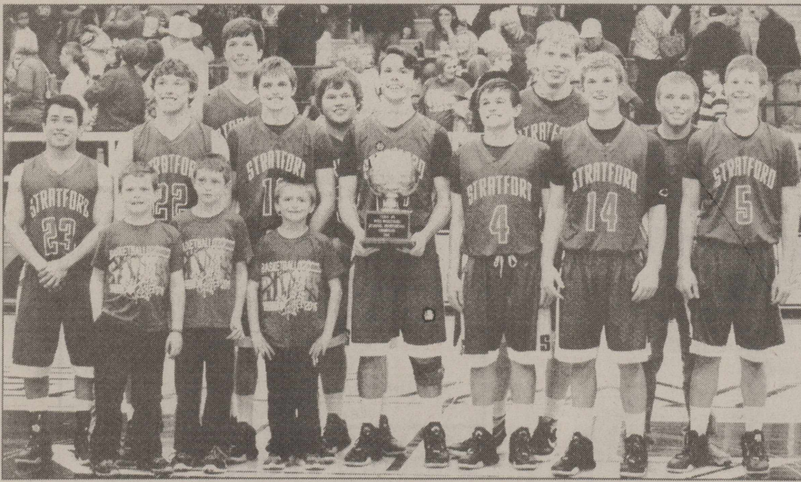
1 st . Texas War-Cont. from page 3

other leaders of the revolt were determined to secede Texas from the nation of Mexico and form a new nation, the Republic of Texas.