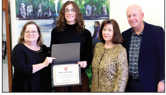
Editor's note: These photos and story were provided to the Herald by Howard College.