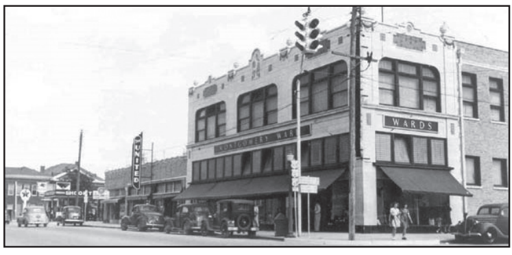
Big Spring's Montgomery Ward Department Store was located at the intersection of Third and Gregg streets from 1929-1965.