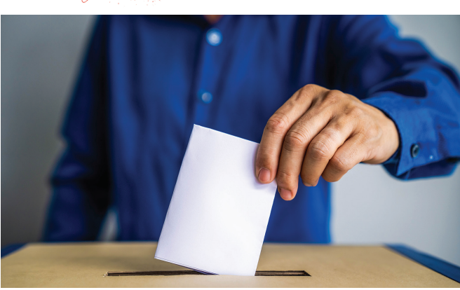
2. COAHOMA VS STANTON