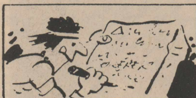
The first system of writing was invented by the Sumerians in ancient Mesopotamia about 3500 B.C.

You can have a happier holiday season by helping your teenager bridge the gap between wanting the joy of a child's Christmas and wanting to feel like an adult who makes decisions about Christmas.