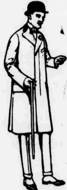
BRANDEGEE KINCAID & CO. CLOTHES.