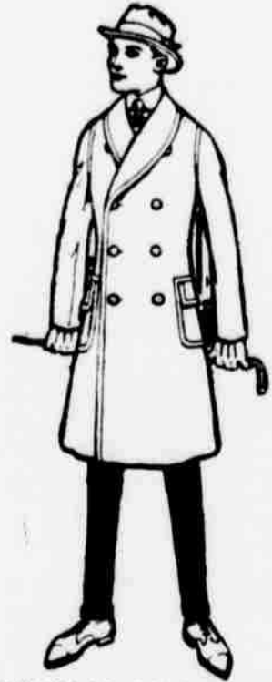
BRANDEGEE KINCAID & CO. CLOTHES.