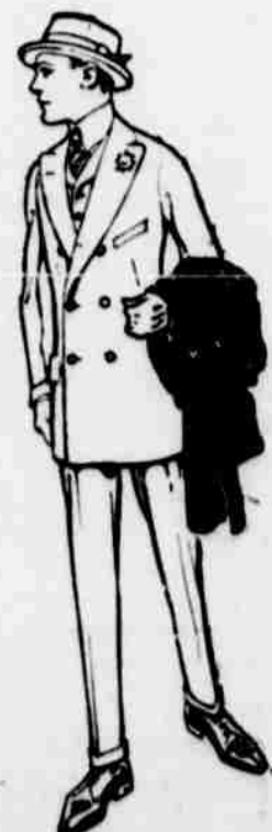
BRANDEGEE KINCAID & CO. CLOTHES.

Get Your Legal Blanks at the Free Press.