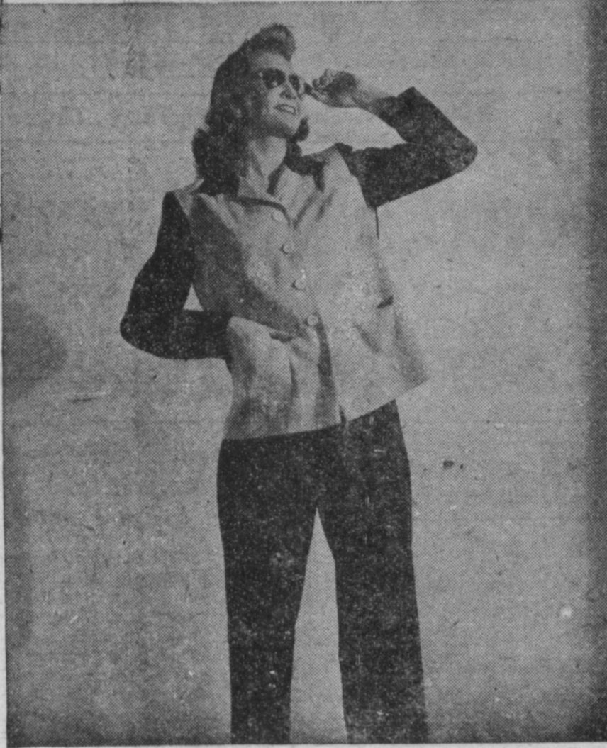
Every well-rounded wardrobe should include a slack suit. They are practical and appropriate, whether you play golf or work in a defense plant.