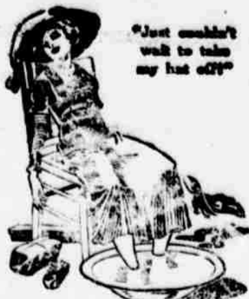
"Just couldn't wait to take my hat off"

Let your sore, swollen, aching feet spread out in a bath of "TIZ."