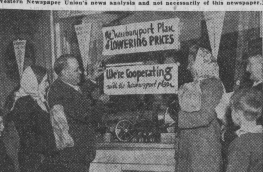
Retail stores in Newburyport, Mass., experienced brisk business after putting into effect a 10 per cent flat reduction in all prices.