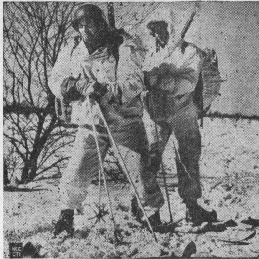
Well camouflaged and warm, too, these members of the 82nd Airborne Division plod through the snow during "Exercise Snowdrop" at a northern post. The National Cotton Council reports the soldiers are wearing light-weight, wind resistant cotton garments made of very tightly constructed fabric. The outer cotton uniform is used over a softer and more resilient undergarment and provides more warmth and comfort than heavy overcoats.