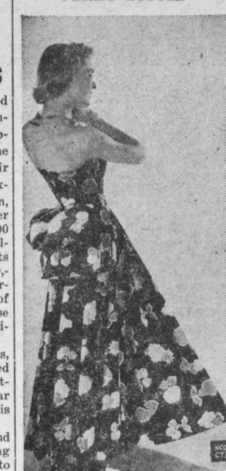
This charming cotton-calico dancing frock proves that the "new look" definitely is the "old look." Cotton calico and bustle styles were favorites of grandma's, just as they are with today's fashion-wise sophisticates. The National Cotton Council says this attractive strapless dress in Ameritex cotton print of gay colored calico fruits was shipped up at home by the pretty—and talented—young lady.

rans, over 1,227,000 man hours. "These people, most of whom are veterans themselves, have established a record for unselfish service of which we are immensely proud," Howell said.