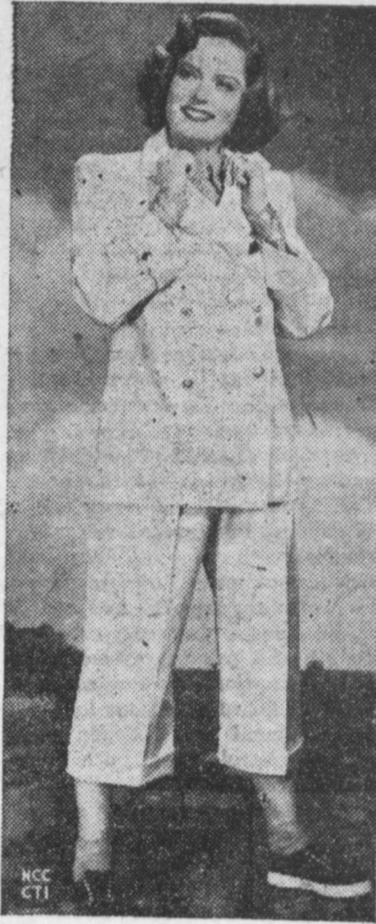
Fish aren't the only ones who go hook, line, and sinker for pretty Alexis Smith when she's wearing such an attractive "fisherman's outfit." Designed by Tina Leser, the three piece ensemble is made of cotton. The National Cotton Council says the short slacks and jacket are of cotton sail cloth, and the striped shirt matches the jacket lining. Miss Smith is now appearing in Warner Bros. "Woman in White."