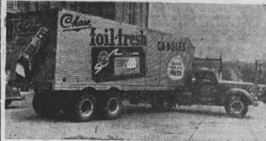
To coordinate operations at their St. Louis, Chicago and St. Joseph, Mo., plants, Chase Candy Co. last year put three insulated stainless steel trailers in service. As a result production zoomed and sales kept pace, showing an increase of 3 1/2 million dollars for the second half of the year over the corresponding period in 1946. The Fruehauf trailers are on the road night and day carrying 28000-pound payloads over the 1100-mile route. Insulation provides constant protection for the candy in any weather.