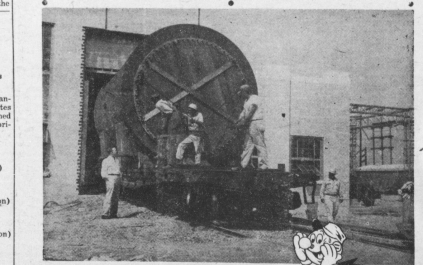
A huge, new condenser for La Palma Power Station's Number 5 generating unit is shown upon arrival at the San Benito plant. This is only one part of the 20,000 kilowatt generating unit, which is expected to be in operation early next year.