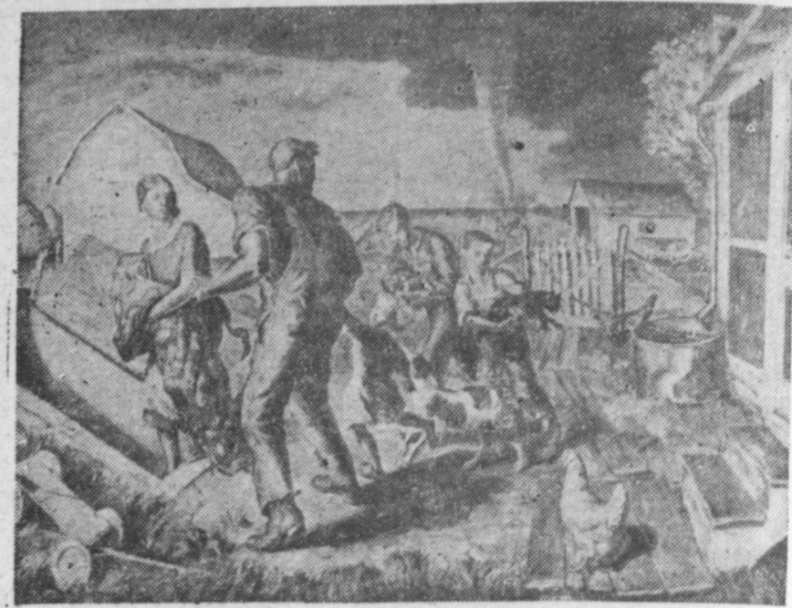
"The Tornado," John Steuart Curry's famous oil, has been acquired for the Dallas Museum of Fine Arts' exhibit of "Famous Painting by Famous Americans" at the 1948 State Fair of Texas, Oct. 9-24. The exhibit will include Grant Wood's "American Gothic." A collection of paintings by contemporary Mexican artists, including Diego Rivera, David Siqueiros, Rufino Tamayo, and Jose Clemente Orozco, also will be exhibited.