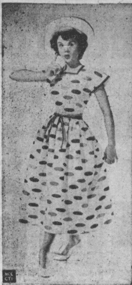
This pretty little miss is coy as can be in her fresh cotton pique frock splashed with vivid polka dots. Created by Lil' Alice, the cotton dress is designed to keep the young lady cool and collected in any summer situation.