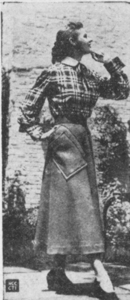
The college set this season has nominated the plaid cotton blouse as number one on the hit parade of adaptable fashions for campus wear. The bright plaid cotton makes an excellent teammate for solid skirts or jumpers. This smartly tailored cotton plaid blouse was designed by Clifford of del Mar, the National Cotton Council reports.