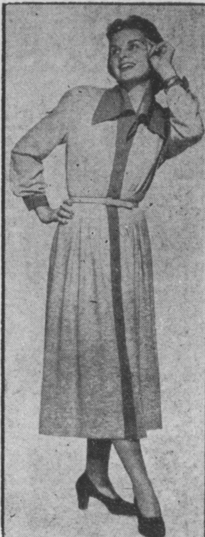
ALL-PURPOSE —Collar cuffs and buttons from neck to hemline are set off with contrasting tone crepe on this go-everywhere casual in wool jersey. A famed designer's original, this winter wool has a wide convertible collar.