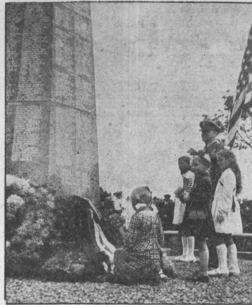
TRIBUTE TO U. S. HEROES— Lt.-Gen. Clarence R. Huebner of the European Command attends the inauguration of the Bulange, Belgium, Memorial and the Henri Chapelle Memorial for the dead of the First American Army in World War II in the Belgian Ardennes. Belgian children paid honor to the Americans who lost their lives in that sector.