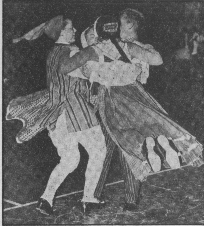
JITTERBUGGING A LA DENMARK —A vigorous folk dance is performed by four of the 24 Danish gymnasts who staged a popular exhibition at New York University recently. The young men and women, all amateurs selected from among Danish schools and clubs, have planned a year's tour in the U. S. and Mexico.