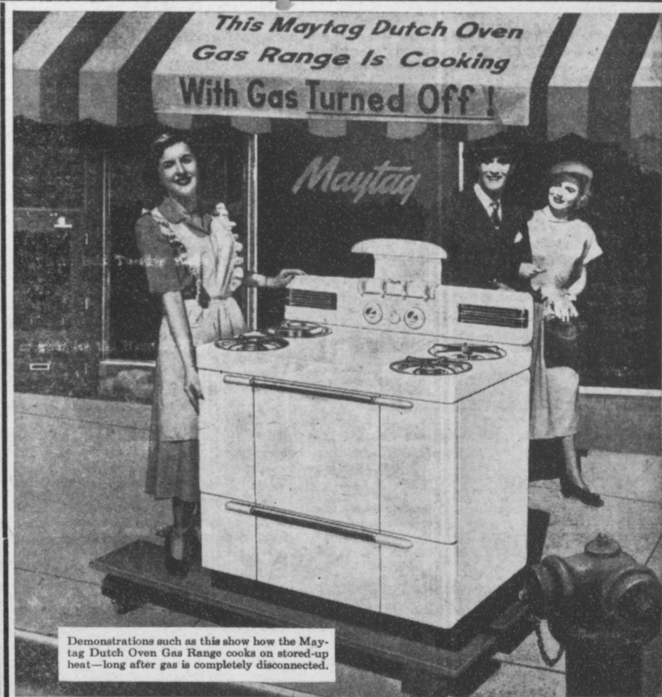
Demonstrations such as this show how the Maytag Dutch Oven Gas Range cooks on stored-up heat—long after gas is completely disconnected.

WATCH FOR THE TRUCK WITH THE MAYTAG DUTCH OVEN GAS RANGE COOKING WITH THE GAS OFF!