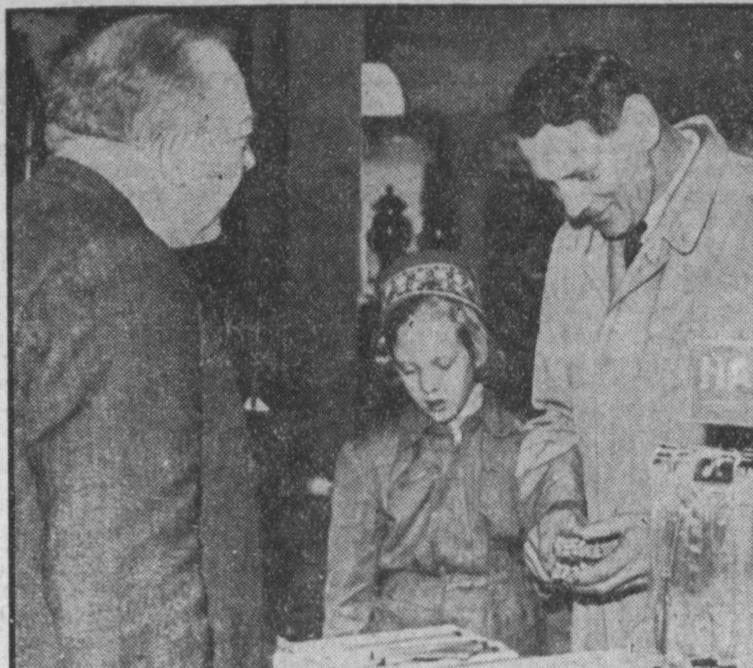
KING GOES SHOPPING —Just like any other shopper King Frederik IX, of Denmark, looks over what he buys as he goes shopping in the North Jutland village of Farsoe with his eldest daughter, Princess Margarethe. The village is close to the king's hunting cottage, where the royal family spent their winter vacation.