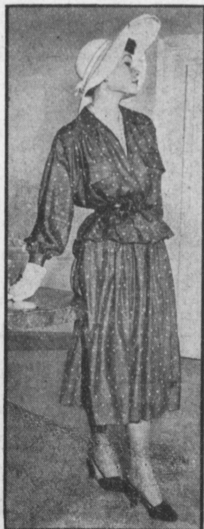
IT'S COCOA TIME — Belted and bloused, this pure silk shantung afternoon dress, done in warm cocoa with white embroidery, is shown in the French designer's New York salon. The full skirt is topped by a belted blouse featuring the dropped shoulder line and full, long sleeve.

I Will Continue to Handle Merle Norman Cosmetics