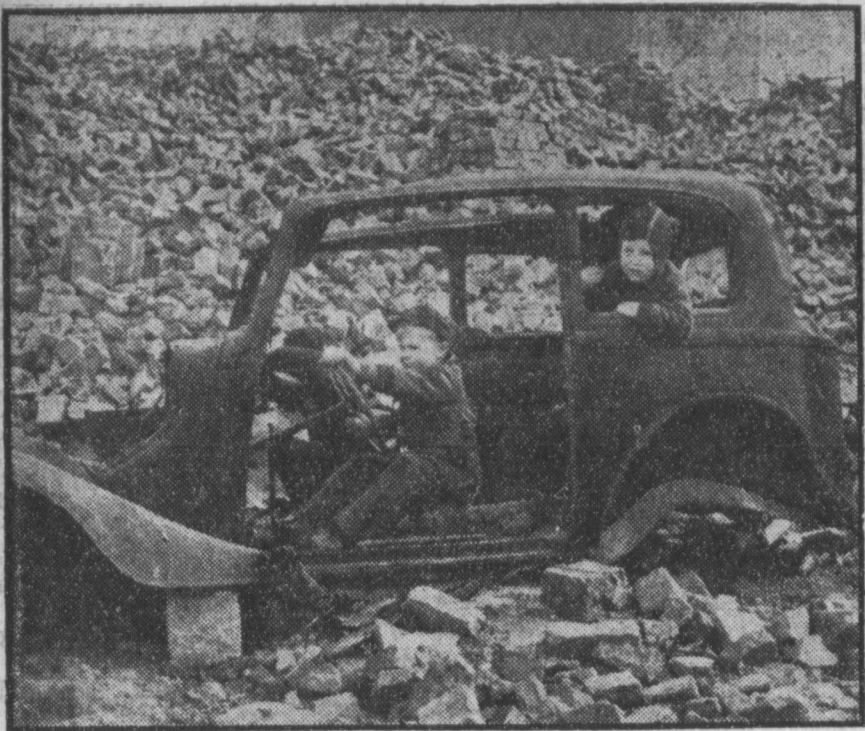
PLAYTIME AMID SCARS OF WAR —Four years after the war's end, many sections of Berlin are still clogged with the rubble of bombed buildings and wrecked army equipment. These grim mementos, however, have a lighter side—they serve as playgrounds for German children, offering no end of adventure. These youngsters are playing in the wreckage of a former German Army staff car amid the ruins of a street in the U. S. sector.