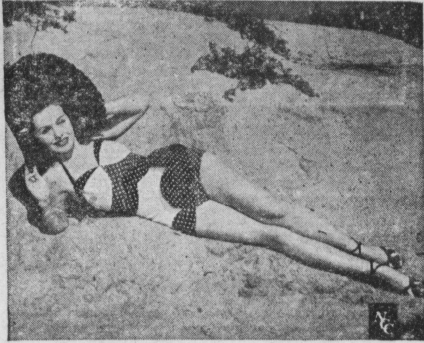
Jeanne Crain, star of 20th Century-Fox's new movie, "Take Care of My Little Girl," takes it easy in the California sunshine during her siesta time. Her smart cotton swim suit is made of snow white pique, lined and trimmed with polka dot cotton in navy and white and red and white.