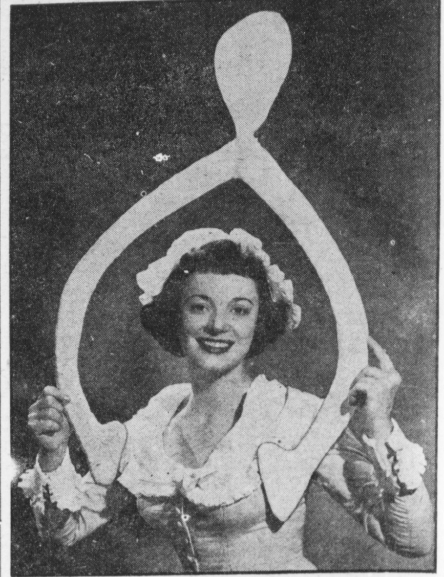
WINSOME WISH —Gisele MacKenzie, radio singing star, shows with a giant wishbone the extent of her good wishes to all listeners. Gisele intends to eat well but little on Thanksgiving. She has to watch her shape. This is silly, with so many fellows wanting to do it for her.

Private owners of used automobiles are also restricted from selling above the ceiling price, but the new regulation permits, as did the old, a trade-in at above ceiling prices.