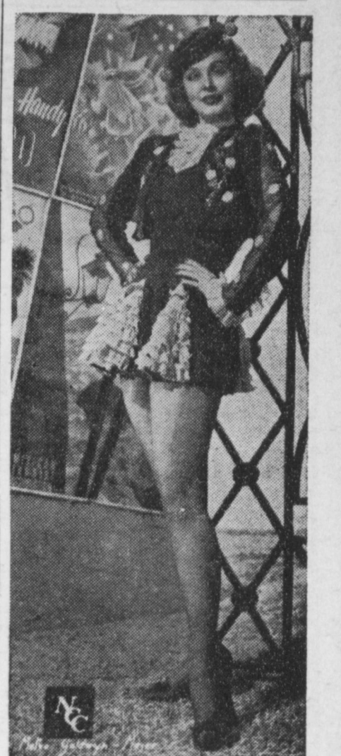
Lucky the bull that enters the ring with this goodlooking matador! Pretty Arlene Dahl, popular MGM star, wears an eye-catching bull-fighting costume of bright red cotton velveteen. (Don't worry, fellas—Arlene just donned the velveteen bullfighting costume to accommodate the Mexican Tourist Association.)