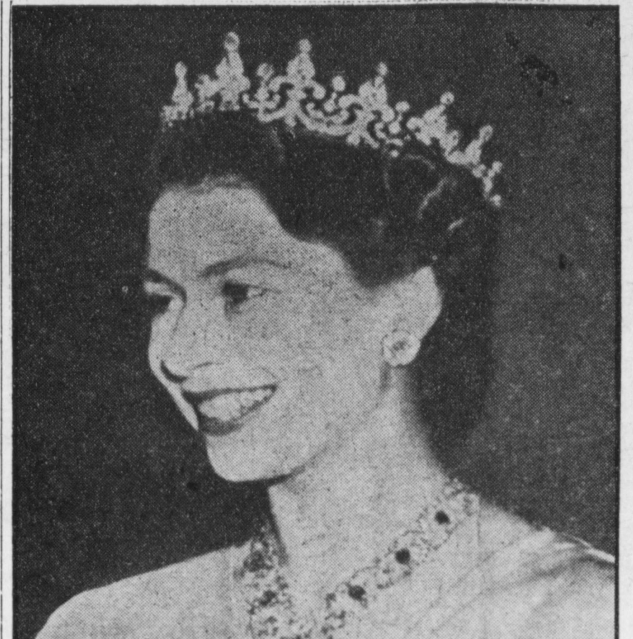
ROYAL CHARM-The new Queen Elizabeth is known for her royal dignity and charm, as Americans who saw her during her recent visit here can testify. The popular 25-year-old ruler is shown flashing her sunny smile as she attended a recent London film premiere.

Income tax reports must be filed making $600 or more must file.