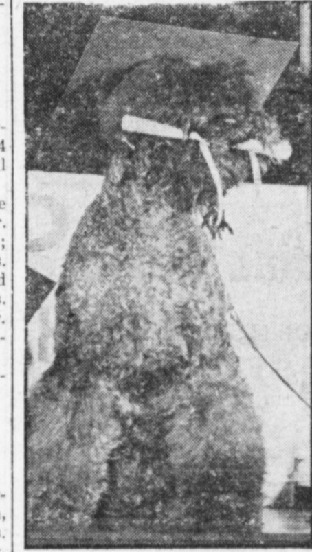
MAGNA CUM DOGGY—Mustering all his canine dignity "Mickey," a four-year-old Kerry Blue terrier, shows his hard-won diploma to the audience during graduating ceremonies at Flag Dog school in New York. "Mickey," who specialized in canine manners and human psychology, graduated "magna cum doggy."