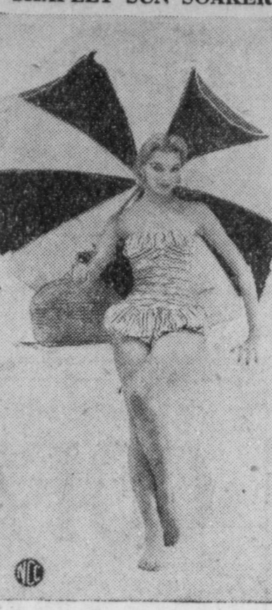
Here's what shapely vacationers at Southern resorts are wearing this season while they soak in their Vitamin D supply from winter sunshine. Of elasticized woven cotton seersucker, this swim suit by Brilliant Sportswear has a molded torso that fans out to make a bloomer effect.