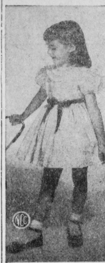
This little miss is ready for a party in a charming frock designed for such special occasions. Her party dress by Hedy-Joyce is made of Simpson's Everglaze lawn, a crisp, sheer cotton that stays un-mussed because of its crease-resistant finish. Rows of baby lace form a dainty yoke effect and velvet ribbon makes a pretty bow in front.