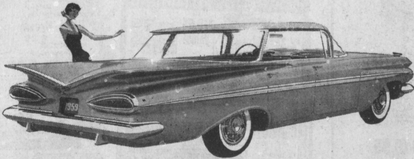
The bright new Bel Air 4-Door Sport Sedan with the same fine, fresh body styling as the most luxurious Chevrolets.