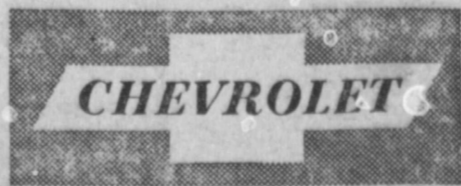
The smart switch is to the '59 Chevy!

the super-softness of Full Coil springing, in Easy-Ratio steering—then you'll know that this is the happiest surprise of the year. Come on in; don't miss this Open House!