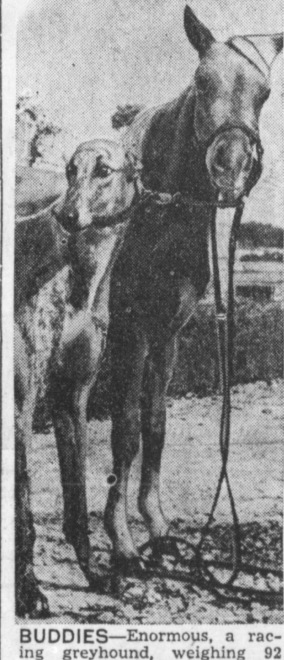
ing greyhound, weighing 92 pounds, stands next to a Shetland pony in Miami, Fla. The dog is reputedly the world's largest of his species.