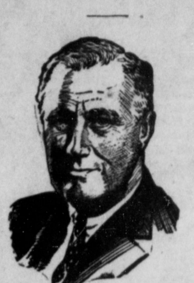
FRANKLIN D. ROOSEVELT