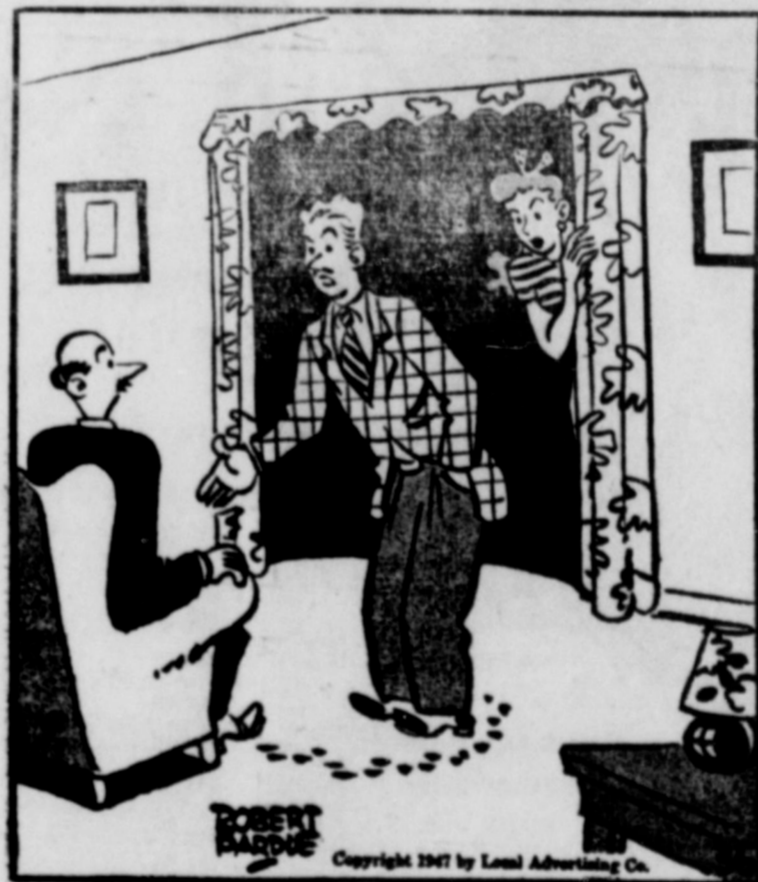
"I don't make much money Mr. Smith, but I'm smart. MASON CHEVROLET COMPANY does my car work."

TYRONE POWER and ANNE BAXTER in "THE LUCK OF THE IRISH"