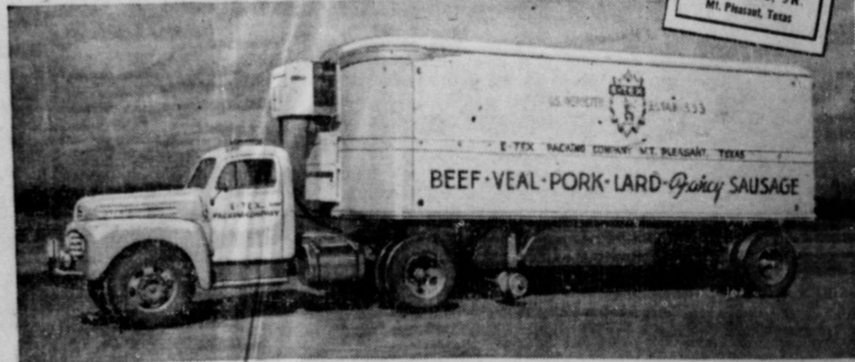
Ford 145-horsepower Model F-7 BIG JOB shown has Gross Combination Weight rating of 35,000 lbs. as a tractor; Gross Vehicle Weight rating of 19,000 lbs.

"Our two Ford BIG JOBS have given better performance than any trucks we ever owned"