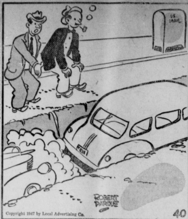
"Folks are really beating a path to MASON CHEVROLET COMPANY these days."