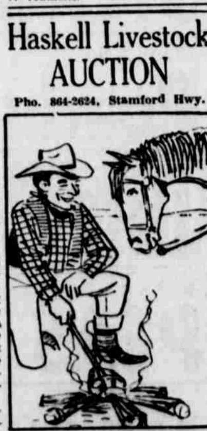
OL JED PLAYS THE HORSES BY DAY IN HIS WIFE NAGS BY NIGHT.

Haskell Livestock AUCTION Pho. 864-2624, Stamford Hwy.