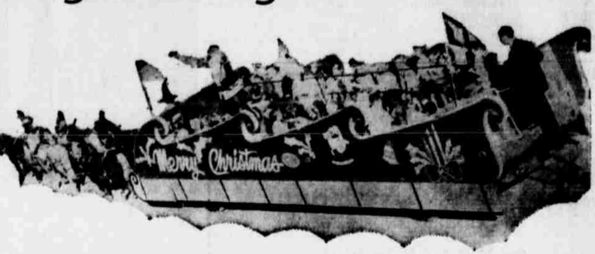
HERE COMES THAT MAN AGAIN: Santa Claus and his giant 30-foot sleigh, will be in town all day Saturday, December 6th. Free rides on "The World's Largest Sleigh", awaits all good little boys and girls.