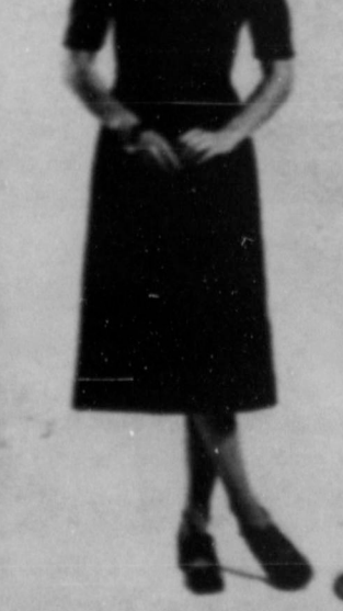
NEW LENGTH —Double knit cotton interprets the newest look in fashion: the mid-dress with round scoop neckline and the longer length sleeves. By Miss Ingemore, the dress comes in brown, navy, or burgundy.