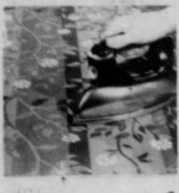
LAMINATING —To make decorative cotton window shades, iron fabric to Tontine adhesive shade cloth. Work from center to outer edges and use liner paper as pressing cloth. Leave 2-inch strip at top of shade cloth for later use in attaching shade to roller.