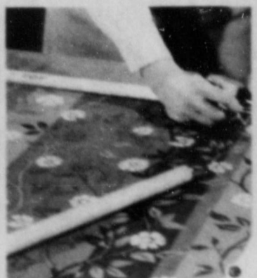
TRIMMING —After ironing fabric to shade cloth, mark side edges for cutting. Use shade roller as guide and mark line on fabric 1/4" from the inside of metal caps on each end of roller. Draw vertical lines with tailor's chalk down each side of shade to outline width. Cut along these lines for finished edges.