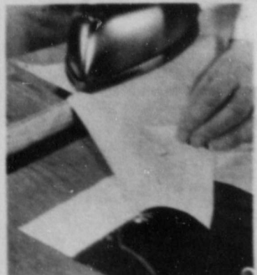
ATTACHING ROLLER —Press lower edge of 8" Tontine strip adhesive-side down on bare strip at top of shade. Let cool and trim. Then lightly press upper edge of strip to blue line on roller. Wind Tontine over roller surface, constantly pressing until you reach end of adhesive. Now your shade is ready to hang.