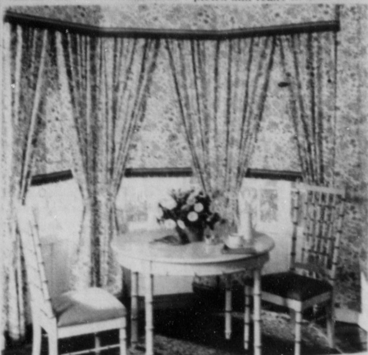
HIGH FASHION SHADES —A new boon to do-it-yourselfers is a shade laminating kit that provides first aid for ailing windows. Here it's used to create cotton fabric shades that match curtains and wallpaper. The kit includes Tontine adhesive shade cloth, roller, slat, pull, mounting brackets and screws. It's by Stauffer Chemical Company.

(7) Place upper edge of shade cloth strip along blue line on roller and press just enough to anchor this edge to roller. Wind shade over roller surface, constantly pressing to obtain a complete bond. Continue to roll and press until you reach the end of the adhesive. Now your shade is completed and ready to hang.