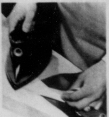
SLAT POCKET —Fold 1 1/2" strip at bottom shade over to the back and press hem edge. Place 2" Tontine strip adhesive-side down on folded edge of hem line and press lightly. Insert slat laying lower edge flush with inside fold of hem. Press firmly along upper edge of slat. Allow shade to cool and then trim.