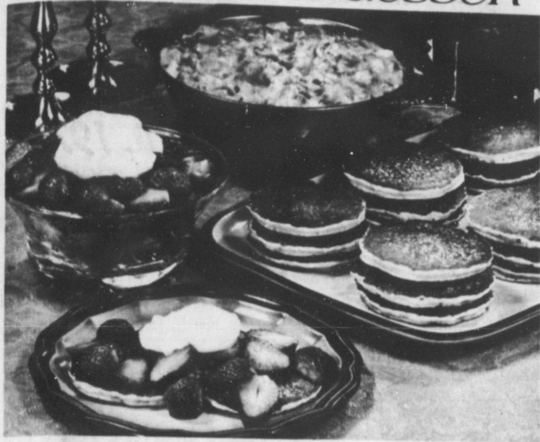
Pancakes are lowly no longer! Creamed Chicken Royale and fresh Strawberries bring America's favorite breakfast treat to the dinner table amid glory galore.

Dressing up an old favorite for a hearty main course or luscious dessert is always fun. And nothing is as adaptable as the all-American pancake.