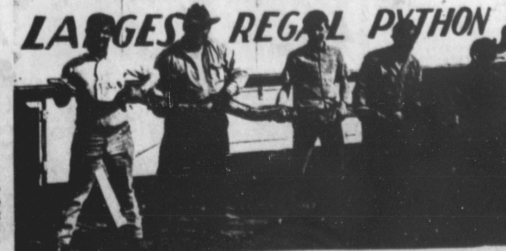
LARGEST REGAL PYTHON

from them in advance you put more money into various projects that they do to help better the community.