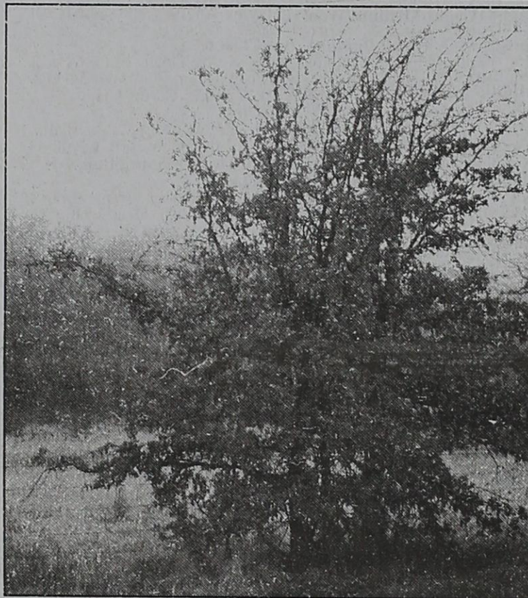
A tree in winter fog...photo by Patrick Ready

inhume: Here is a verb that means to bury something, like a dog does with a bone.