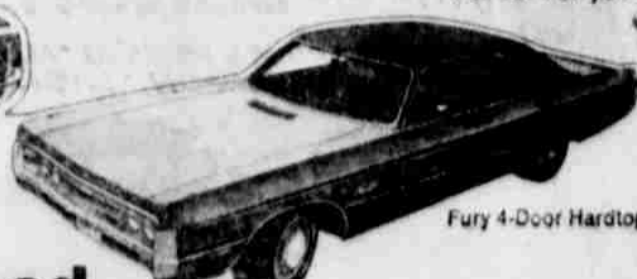
Fury 4-Door Hardtop

Plymouth Fury and Chrysler Royal are big ways to go for people who want the comfort and space benefiting their style of living. Both have Torsion-Quiet Ride (which not only quiets road noise but gives you firm, sure handling). Both have a large interior and trunk space. And both turned out to be the finest cars of their kind in this vintage year.