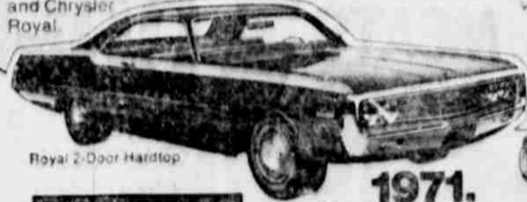
Royal 2-Door Hardtop

It takes something special to come up with a Vintage Year. But that's what 71 has been for Chrysler-Plymouth. Our slogan "Coming Through" had a lot to do with it, because it's our pledge. To come through with the style, size, price and quality you can live with for years to come. Two good examples are Plymouth Fury and Chrysler Royal.