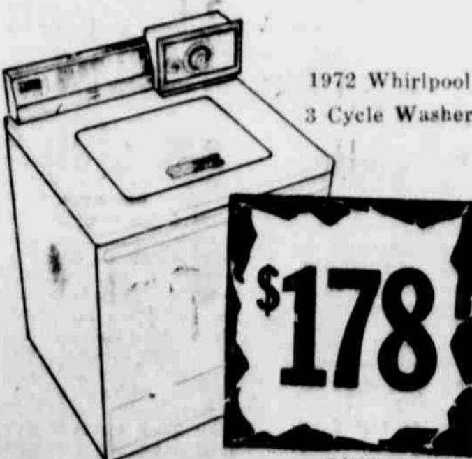
1972 Whirlpool 3 Cycle Washer