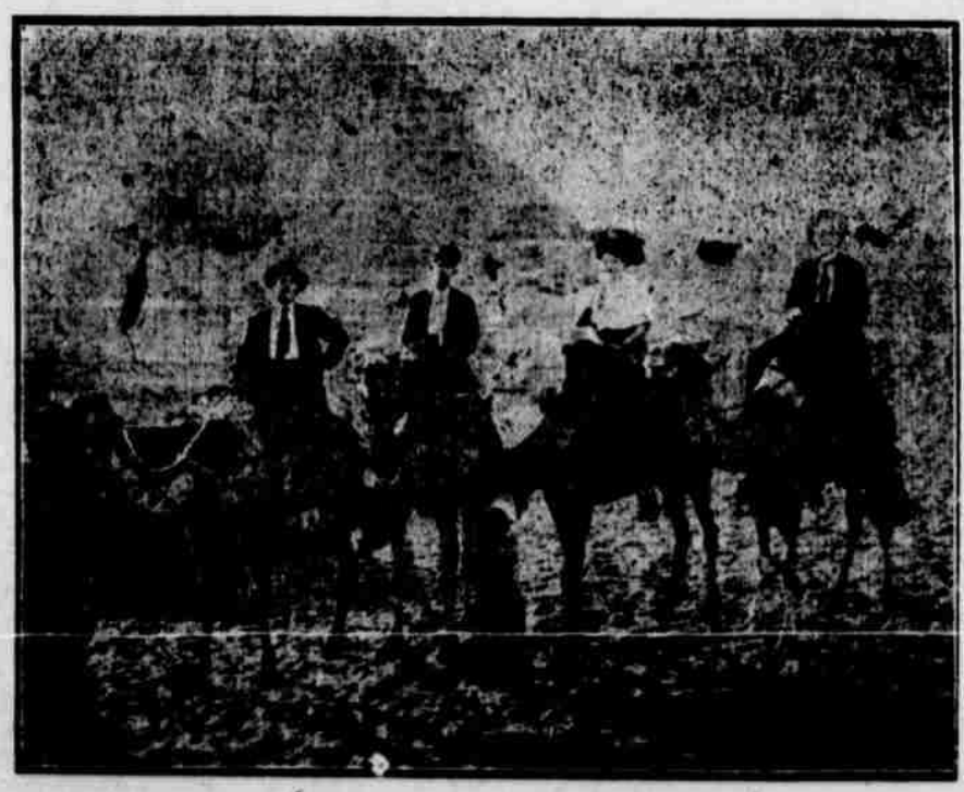
The above cut should have appeared in last issue instead of the one that was printed.