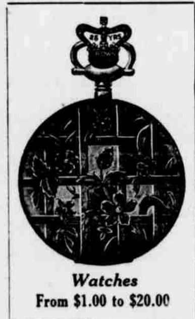
Watches From $1.00 to $20.00

We are Especially Strong on Diamonds, Which Make a Permanent and Appreciable Gift