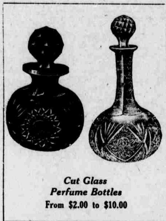
Cut Glass Perfume Bottles From $2.00 to $10.00