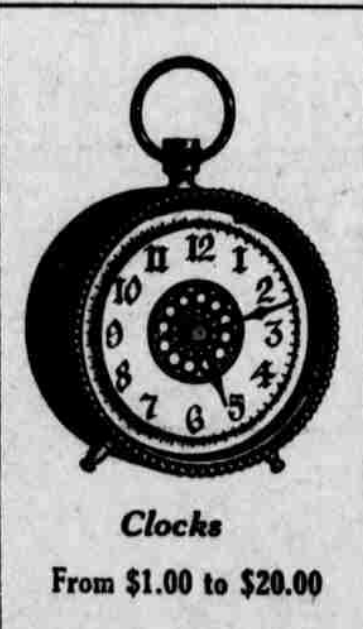
Clocks From $1.00 to $20.00

A bottle of dainty perfume, a pair of gold spectacles, or a teacher's Bible, a weather thermometer.