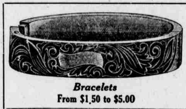
Bracelets From $1.50 to $5.00