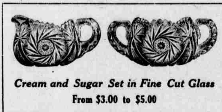
Cream and Sugar Set in Fine Cut Glass From $3.00 to $5.00