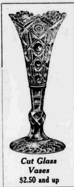
Cut Glass Vases $2.50 and up