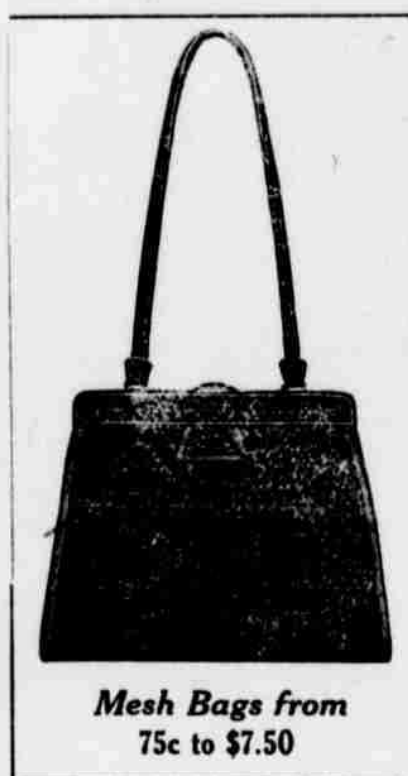
Mesh Bags from 75c to $7.50

Y OU know how it goes every Christmas, how you put off and put off buying your presents from day to day until presently you find yourself face to face with Christmas week or even Christmas Eve, and all your gifts to buy. Then you start out buying at random first here and there, often paying twice as much as you originally intended, for the reason that you have no time to look around. Isn't it about that way? Let us help you out this Christmas season. No more than five minutes time will enable you to carefully note on this list whatever you want to buy. When you are ready to make your selections, whether it is tomorrow morning or the last hour before we close Christmas Eve, come to this store and you will be able to make an intelligent selection for your list, from our stock. And we guarantee you will not pay more than you expect.