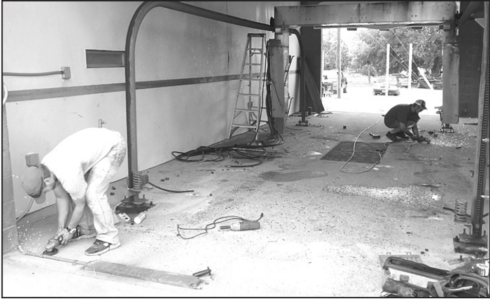
OUT WITH THE OLD-In with the new. The Haskell Car Wash Zone, located on Hwy. 277 North in Haskell, is upgrading their car wash with a new IQ Soft Touch system. The new high tech system will replace equipment that has been in service since 2000. The car wash will be out of service for a few days during the upgrade, but plans to reopen Fri., July 26 with longer hours and additional days due to the new water-friendly system.

•Dual Office Holding A discussion followed covered in the presentation.