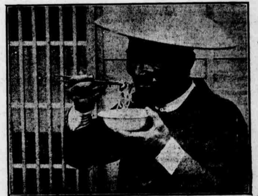
ORIENTAL NEEDS AND HOPES. PRECEDING a portrayal of the blessings promised mankind under the reign of Messiah, present conditions among the down-trodden masses of Oriental lands are pictured. Scenes from India, China and Japan are reeled off, and amidst the characters introduced is the good natured rickshaw coolie above, who was caught by the movie photographer when partaking of a quick lunch before resuming his occupation as a human horse. (From the Photo-Drama of Creation.)