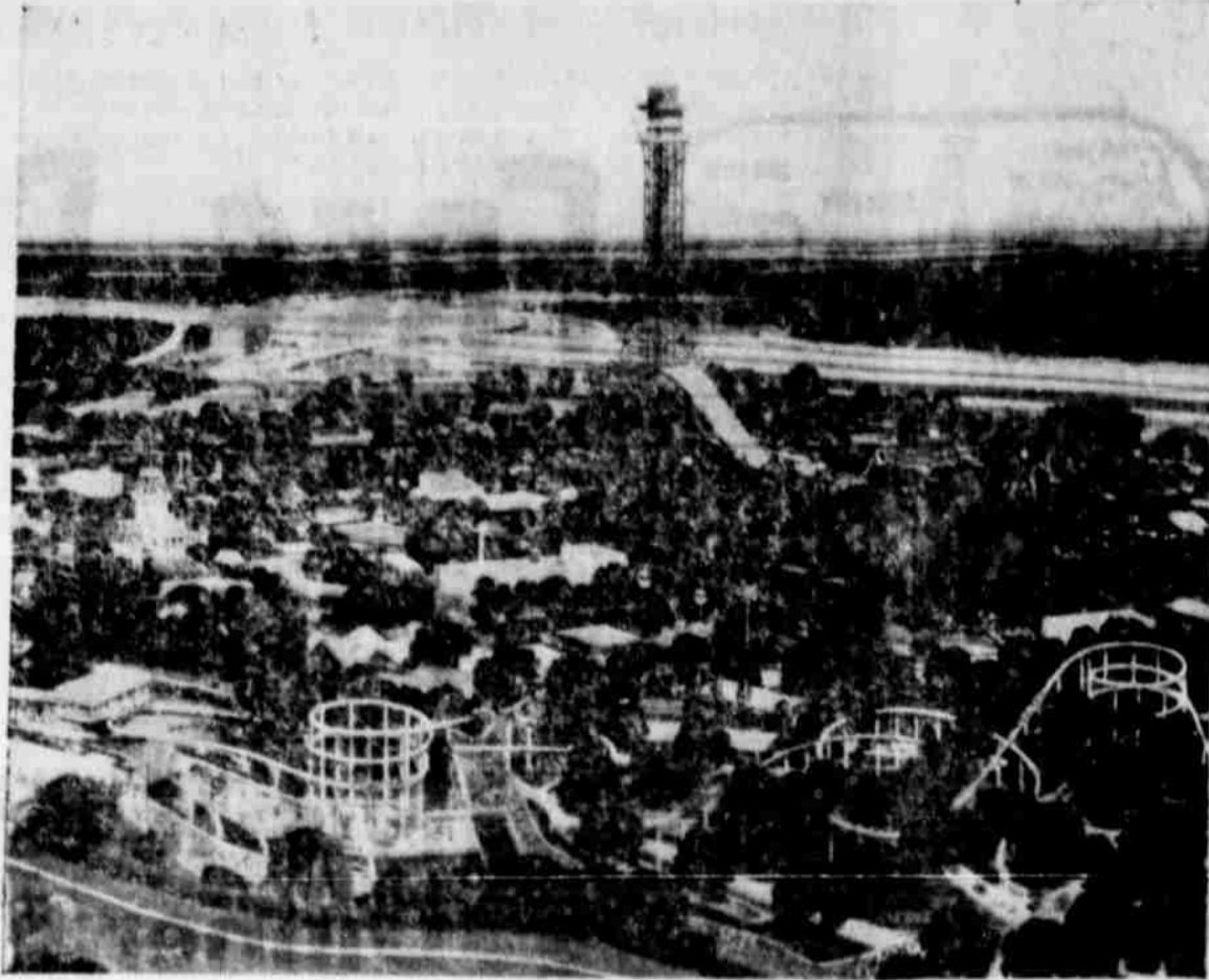
NATION'S FASTEST—The Big Bend, fastest entertainment ride in the nation, is shown in the foreground of this artist's rendering. The huge ride stretches over a large area at SIX FLAGS Over Texas. The new ride, built in Europe, will carry passengers in toboggan-like cars at speeds up to 50 mph.