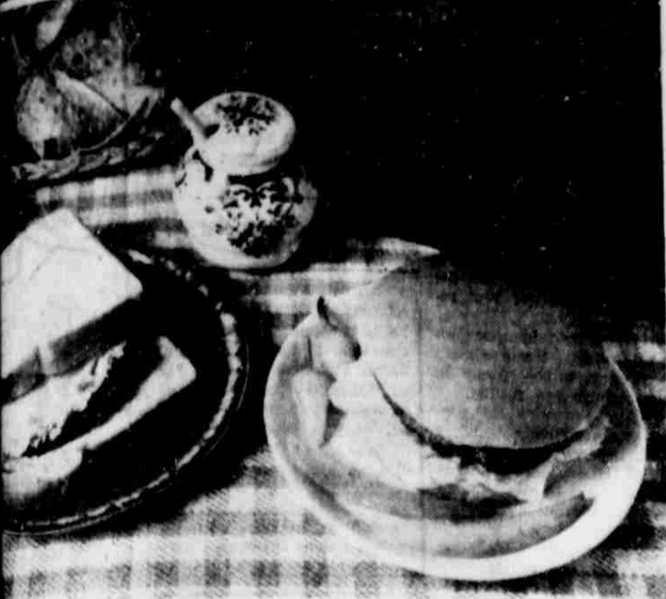
FAVORITE. the Hamburger, had its origin way back in 1891 in Hamburg, Germany. Today's versions don't look much like the original.