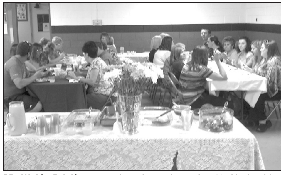
BREAKFAST-Rule ISD personnel were honored Tues., Aug. 20 with a breakfast sponsored by the Rule Chamber of Commerce.

with/wgr tortilla chips, romaine and opt. tomato garnish, salsa, crunchy broccoli salad, season corn,