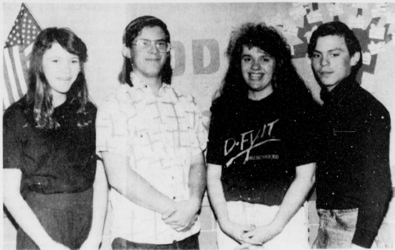
ALL OF THE Rivercrest High School Students receiving superior ratings at the Band Solo

The Housing Authority of the City of Deport is interested in you and your housing needs. Contact the Housing Authority Office at 652-2744, for further information. 3-7