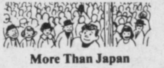
More Than Japan

The fifth smallest state, New Jersey, is the most densely populated one, even more thickly populated than Japan. In some places 40,000 people are jammed into a square mile. Even so, two-thirds of the state is forest and farmland, National Geographic reports.