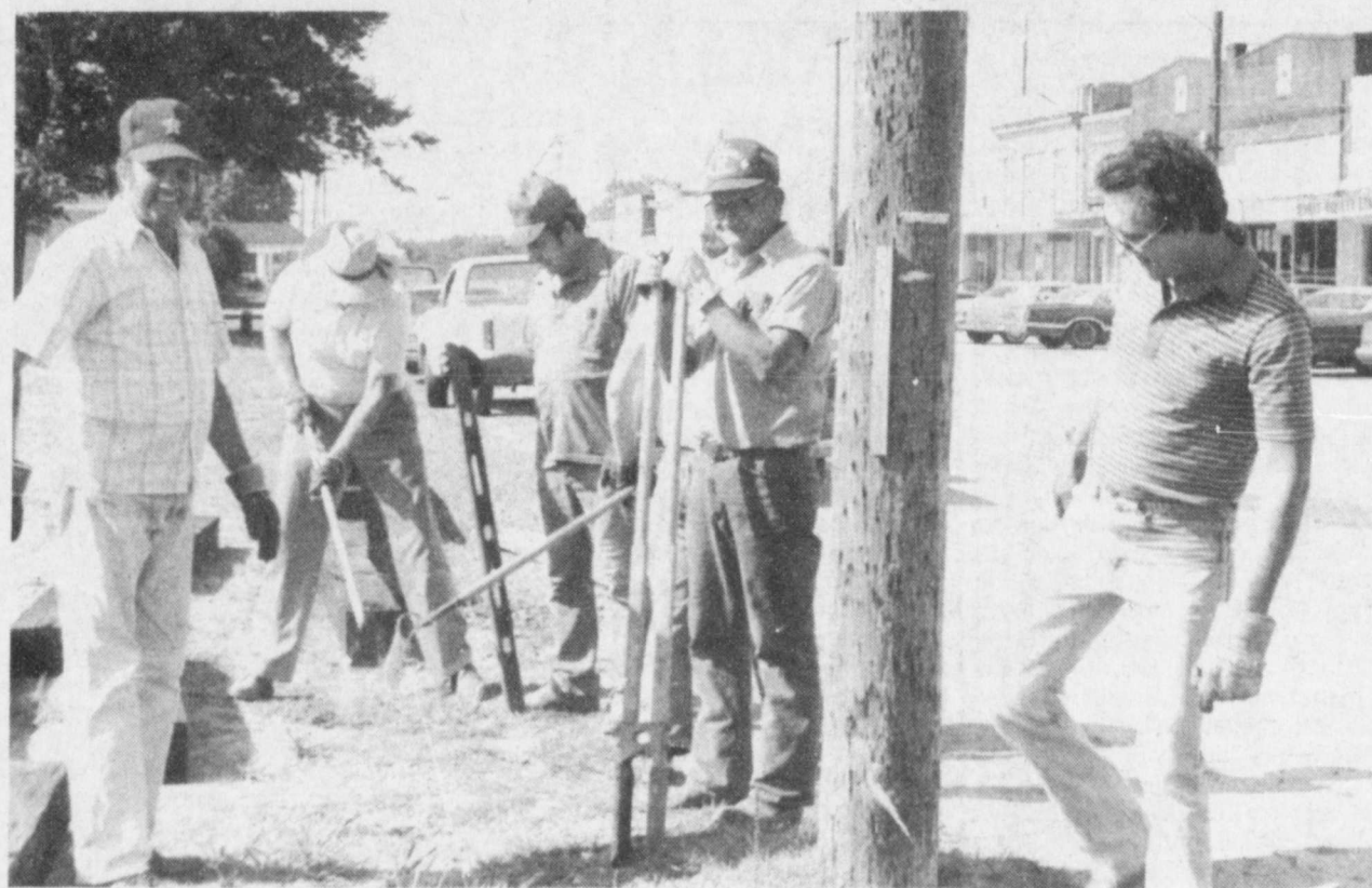
HARD AT WORK on the downtown Deport Park, these members of the Deport Kiwanis