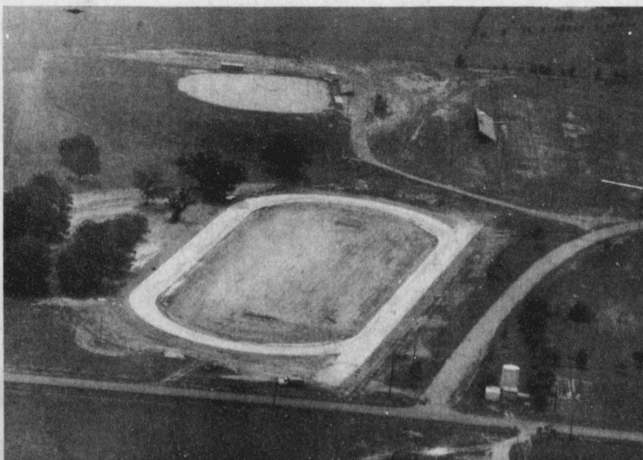
NEW TRACK -The Prairiland track and new football field show

DEADLINE For News and Advertising, Tuesday At Noon. Postmaster send change of address to: The Deport Times P.O. Box 98 Deport, TX 75435