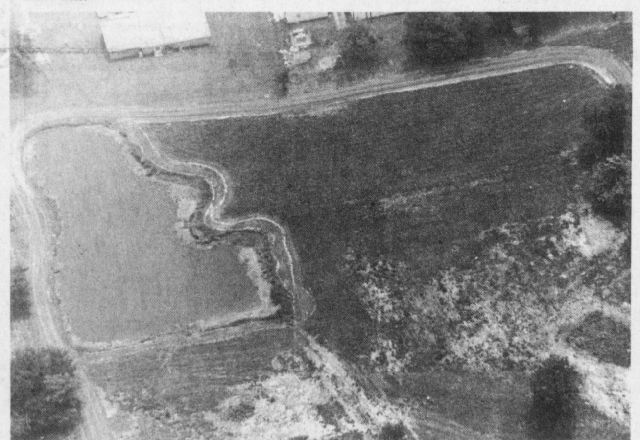
FROM ABOVE -The walking track, already being used in the Deport American Legion Park at