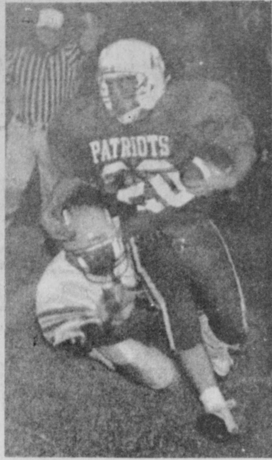
REBEL JV took on the Prairilad JV at Prairilad last Thursday, October 7. The Rebels came with winning on their minds and win they did, 14-0.