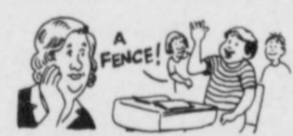
Teacher: "What's the difference between one yard and two yards?" Student: "A fence."

The next FHA activity will be a dinner for the school board members on Monday, October 11.