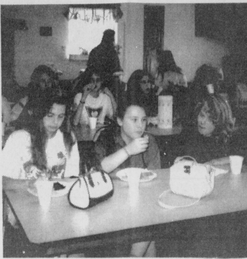
Prairiland and Detroit Future Homemakers had refreshments