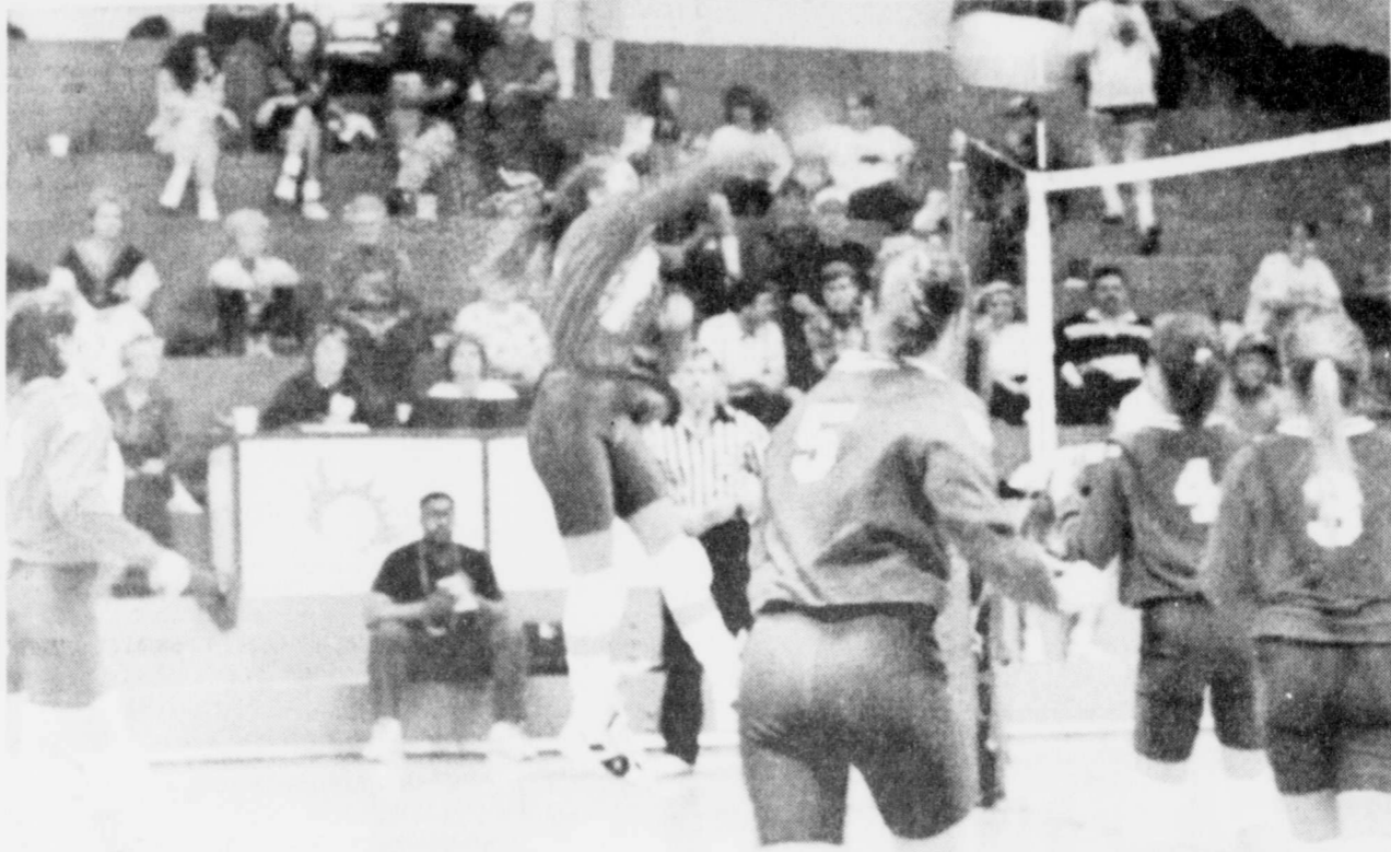
ANOTHER VICTORY-the Prairiland Lady Patriots have continued to roll over all oppo-

Attend The Church Of Your Choice This Sunday