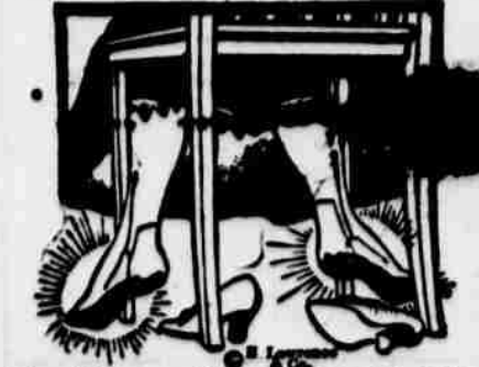
Stop Misery and Embarrassment Like This With Simple, Easy "Gets-It."

Listen to the wee story of "Gets-It," the world's greatest corn remedy. It's a short story—only about two feet—Mary had a little "Gets-It," and corns upon her toe; and every time